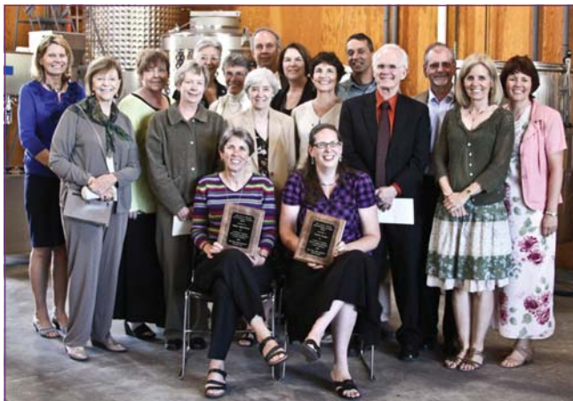
Former honorees and the 2010 McPherson Distinguished Teachers gathered for a photo after the presentation. The 2010 reception and ceremony was held at the Napa Valley Vintners' Teaching Winery.