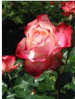
Cherry Parfait John's Rose Garden 2010